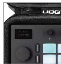
Fits Ableton Move