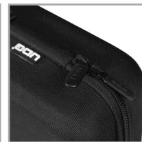
Easy-grip zipper pulls