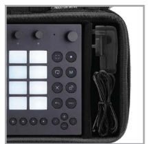
Removable divider for extra cables or power adapter