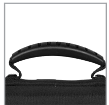
Heavy duty handle