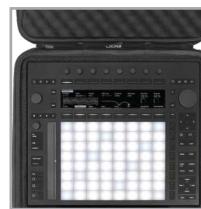
Fits Ableton Push 3