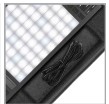
Extra space for power adapter & extra cables