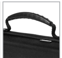
Heavy duty handle