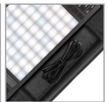
Extra space for power adapter & extra cables