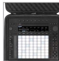
Fits Ableton Push 3