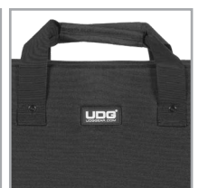
Heavy duty handle