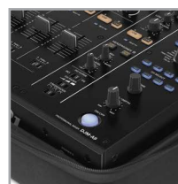
Fits Pioneer DJM-A9