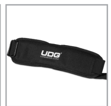
Convenient shoulder strap