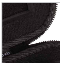
Durashock molded EVA foam