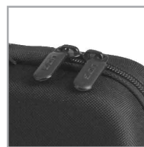
Easy grip zipper pulls