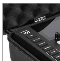
Skilfully moulded to fit the Wolfmix W1