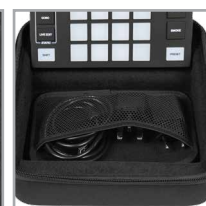
Mesh compartment for power adapter, extra cables