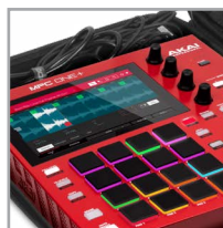
Skilfully moulded to fit Akai MPC One+