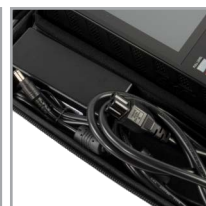
Extra space for power adapter & extra cables