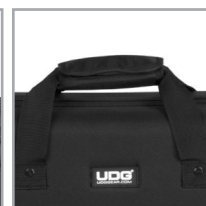
Convenient carry handles