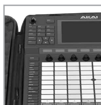
Skilfully moulded to fit the Akai Force