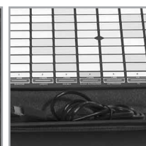
Extra space for power adapter & extra cables