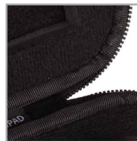
Durashock molded EVA foam