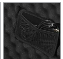
Mesh compartment for power adapter, extra cables