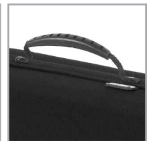
Heavy duty handle