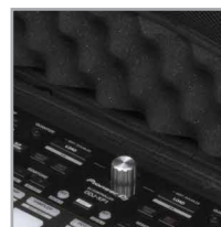
Fits Pioneer DDJ-XP1