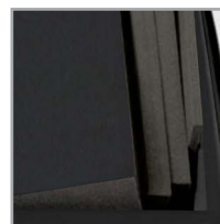
Adjustable EVA padding to customize main compartment