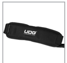
Convenient shoulder strap