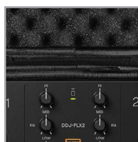
Fits: AlphaTheta DDJ-FLX2