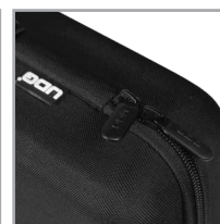
Easy-grip zipper pulls