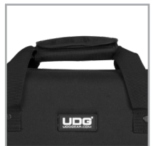
Heavy duty handle