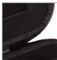
Durashock molded EVA foam