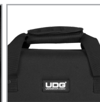
Heavy duty handle