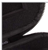
Durashock molded EVA foam