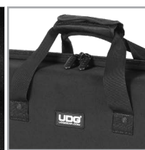
Heavy duty handle