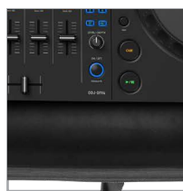
Fits: AlphaTheta DDJ-GRV6 + extra cables