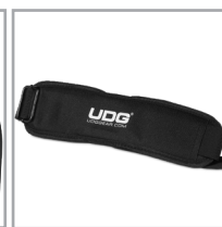
Convenient shoulder strap