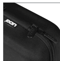
Easy-grip zipper pulls