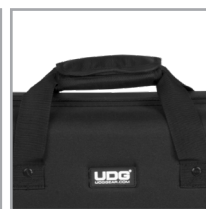
Convenient carry handles