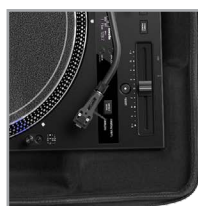
Skillfully designed & molded to fit the Pioneer PLX-CRSS12