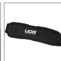
Convenient shoulder strap