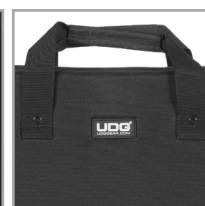
Heavy duty handle