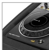
Skilfully moulded to fit Pioneer DDJ-REV1