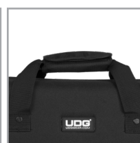
Heavy duty handle