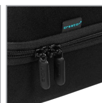
Easy grip zipper pulls