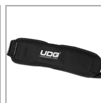
Convenient shoulder strap