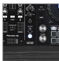
Skilfully moulded to fit the Pioneer XDJ-RX3