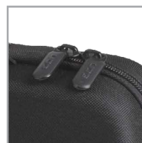
Easy grip zipper pulls