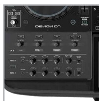
Skilfully moulded to fit the Denon DJ Prime 4+/ 4