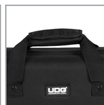
Convenient carry handles