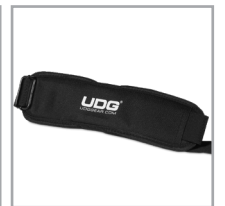
Convenient shoulder strap