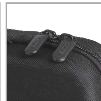
Easy grip zipper pulls