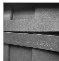
Includes adjustable foam pads