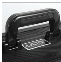
Ergonomic & sturdy carry handle