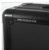
Corrosion resistant aluminum profiles with strong rounded corners