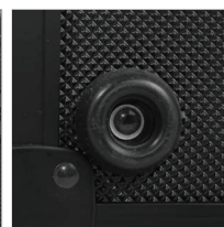
Rubber feet at the bottom for support in standing position