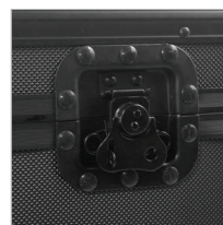
Four strong butterfly lock