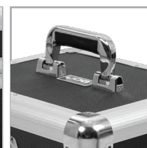
Ergonomic & sturdy carry handle