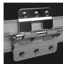
Solid metal hinges