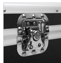
Strong butterfly lock