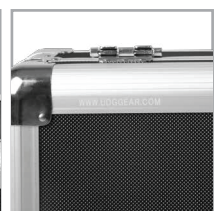
Corrosion resistant aluminum profiles with strong rounded corners