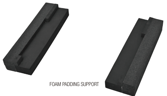
FOAM PADDING SUPPORT