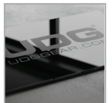
Solid black acrylic construction with a glossy premium finish