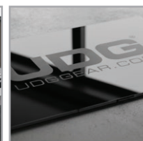
Solid black acrylic construction with a glossy premium finish