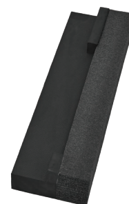
FOAM PADDING SUPPORT