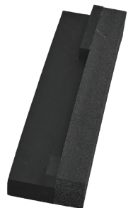
FOAM PADDING SUPPORT