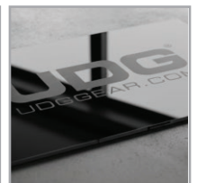
Solid black acrylic construction with a glossy premium finish