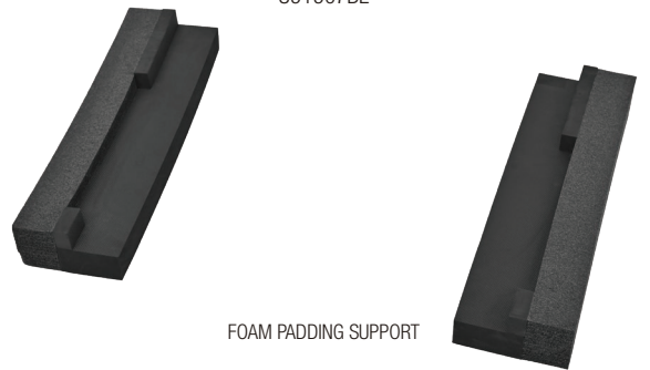
FOAM PADDING SUPPORT