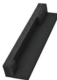
FOAM PADDING SUPPORT