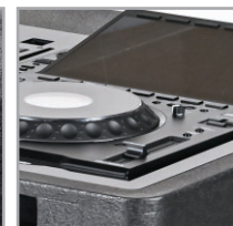
Allows compatible equipment to be mounted in a recessed configuration