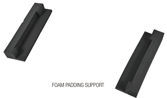
FOAM PADDING SUPPORT