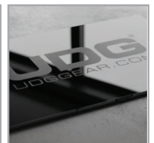
Solid black acrylic construction with a glossy premium finish