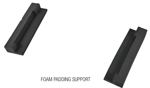
FOAM PADDING SUPPORT