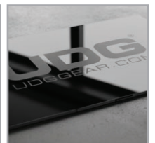
Solid black acrylic construction with a glossy premium finish