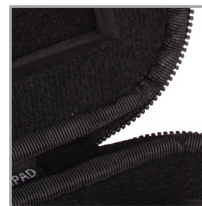
Durashock molded EVA foam