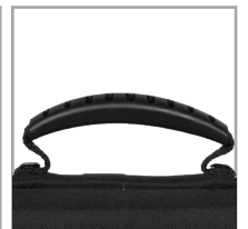
Heavy duty handle