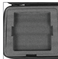
Removable foam compartment for Rodecaster Duo