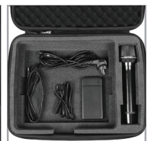
Separate compartment for 1x microphone and power adapter, cables, accessories