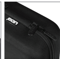
Easy-grip zipper pulls