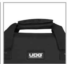
Convenient carry handles