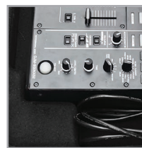
Power adapter & extra cable storage