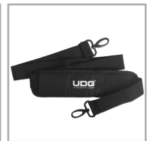
Convenient shoulder strap