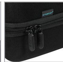
Easy grip zipper pulls