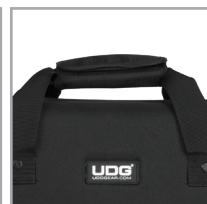
Heavy duty handle