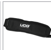
Convenient shoulder strap