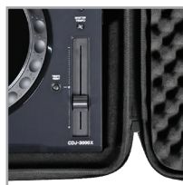
Fits AlphaTheta CDJ-3000X