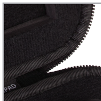
Durashock molded EVA foam