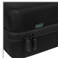
Easy grip zipper pulls