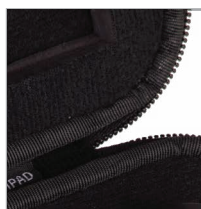
Durashock molded EVA foam