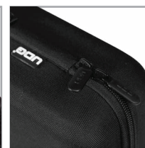
Easy-grip zipper pulls