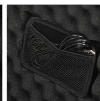
Mesh pocket for power adapter, extra cables