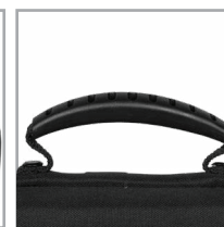
Heavy duty handle