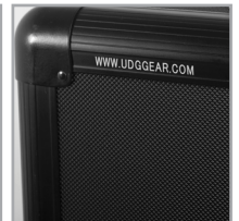
Corrosion resistant aluminum profiles with strong rounded corners