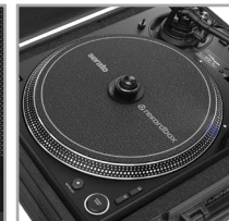
Skillfully designed to fit the Pioneer PLX-CRSS12