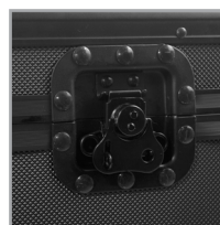
Two side strong butterfly lock