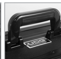
Ergonomic & sturdy carry handle