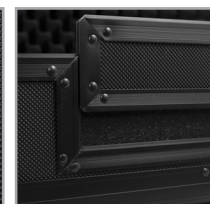
Right & left side removable access panel