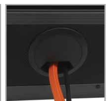
Rear access cable hole with cover