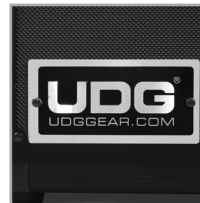
High grade aluminium UDG logo plate