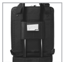
Slides over any trolley