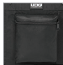
Front pocket for cables and accessories