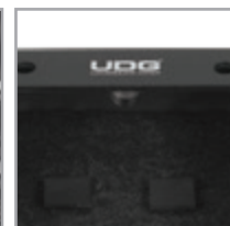
Removable cable & PSU storage cover panel