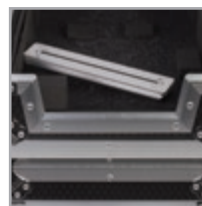
Removable front access panel