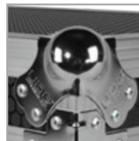
Secure stacking due to stackable ball corners