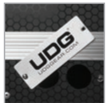
Cable access hole with removable UDG emblem cover