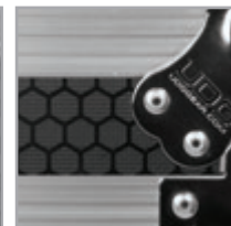
Improved powder coated and anodized hardware