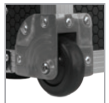
Built-in corner wheels with high quality in-line skate bearings