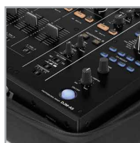
Fits Rane Twelve