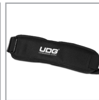
Convenient shoulder strap