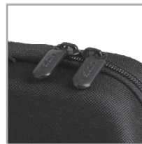
Easy grip zipper pulls