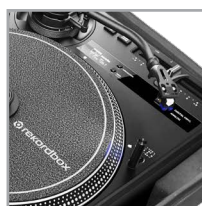
Skillfully designed & molded to fit the Pioneer PLX-CRSS12