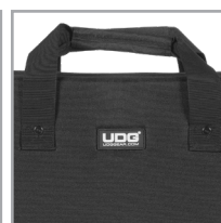
Convenient carry handles